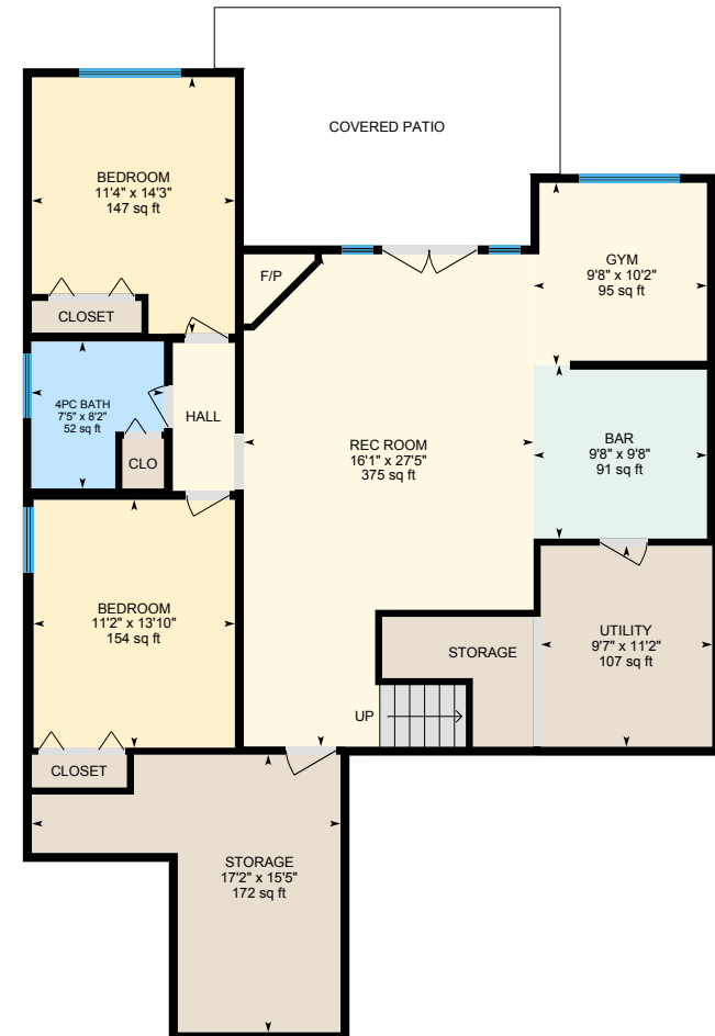
Basement (Below Grade) Exterior Area 1467.35 sq ft