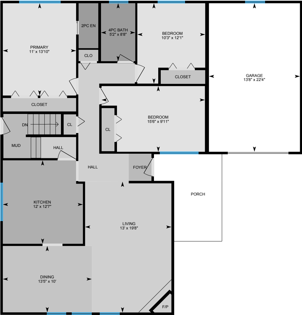
Main Floor Exterior Area 1342.12 sq ft

Main Building: Total Exterior Area 2197.72 sq ft