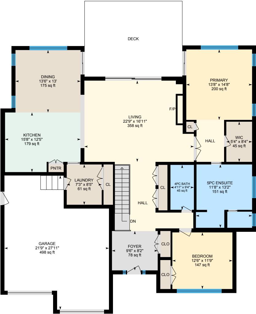
Main Floor Exterior Area 1993.21 sq ft

Main Building: Total Exterior Area Above Grade 1993.21 sq ft