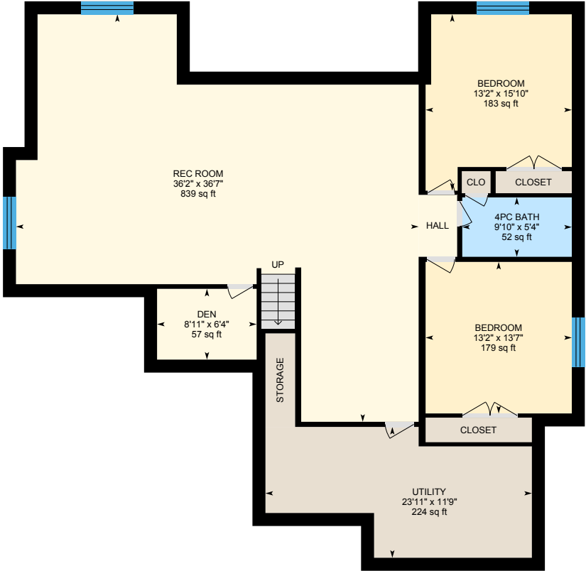
Basement (Below Grade) Exterior Area 1946.70 sq ft