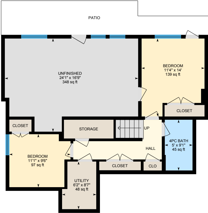
Basement (Below Grade) Exterior Area 982.37 sq ft