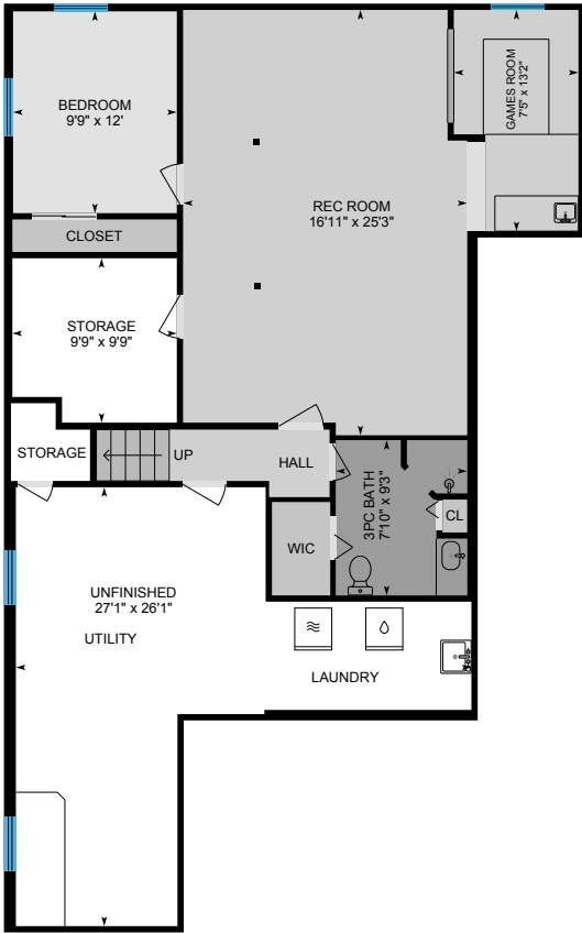
Basement (Below Grade) Exterior Area 886.90 sq ft